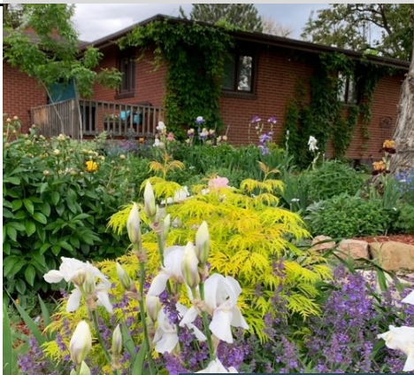
Cynthia St. Charles Garden

Cynthia has created a densely planted cottage garden focused on companion planting with a staggered lengthy bloom schedule – combining hardy perennials and drought tolerant annuals. No Dig /No Till Lasagna garden construction has been used to build new flower beds directly on top of sod by layering compost over cardboard. All classes of bearded iris are grown with a special interest in Historic, Arilbred and Miniature Tall Bearded.