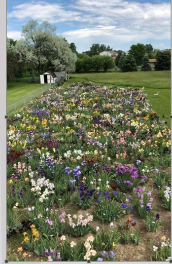
Muriel's Iris Garden

Muriel's Iris Garden is a small family owned business with 1,000 varieties of primarily tall bearded iris. The garden balances a mix of historical and newer variety iris and an assortment of other flowers and peonies.