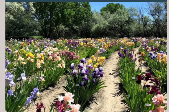
Tina and Daughters Iris Garden

Tina and Daughters Iris Garden has been in business 27 years. They began with just 300 varieties and have grown to over 2,500 varieties on an acre of developed gardens. They specialize in tall bearded and historical iris but also grow intermediate, rebloomers, and dwarf iris. Their location, near the Yellowstone River, is home to wildlife like roaming deer, stunning 200 year old cottonwood trees, and surrounded by Russian olive trees.