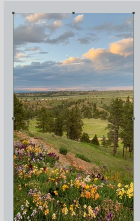
Eagle Ridge Iris Gardens

Little Bighorn Battlefield is a National Monument preserving the site of Custer's Last Stand.