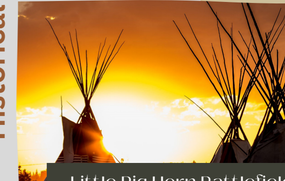
Little Big Horn Battlefield

Little Bighorn Battlefield is a National Monument preserving the site of Custer's Last Stand.